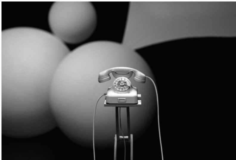
Figure 3. The telephone, with the “clouds” behind it.

The set design also contains aspects related to other inhabitants of the sky: birds. Wooden elements evoking bird’s feet (an idea previously developed in the constellation Mil Pássaros ) are used to support the webcams that record the images for Zoom, as well as two instruments that look almost, but not quite, a cello and a violin. Instead of strings, these instruments’ sound emitting sources are meditation bowls. They are, nevertheless, played like their lookalikes, with a bow. They are called “sinolino” for the violin-like, and “cellobello” for the cello-like.